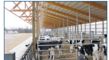
Boyke calf barn