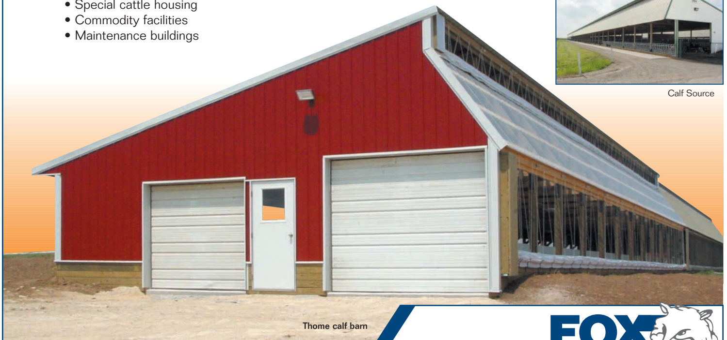
Thome calf barn