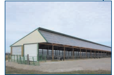
Boyke calf barn